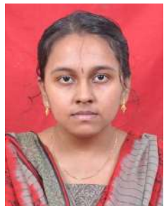
Visalatchi, G. II ECE 90%