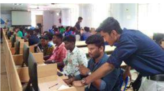
EIE Students - Workshops/Seminar/Industry/In-plant Training/Symposium attended: